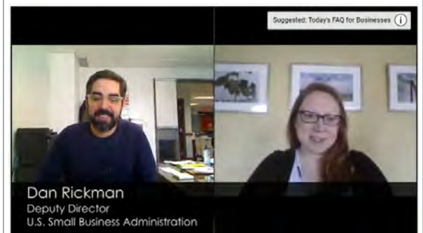
AUBURN Potential tax implications of PPP - Today's FAQ - December 15, 2020

In 2020, CEDA launched a series of videos on YouTube and our social media platforms covering common questions about restrictions, resources, and changes during the initial phases of COVID.